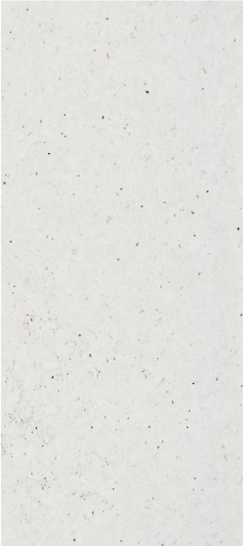
Lime Delight URBAN CRUSH