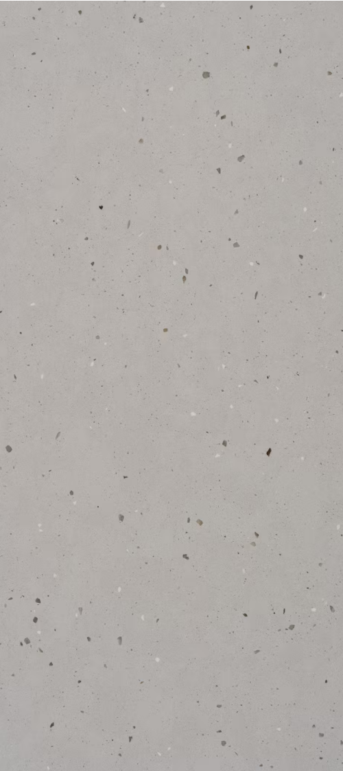
Concrete Pulse URBAN CRUSH