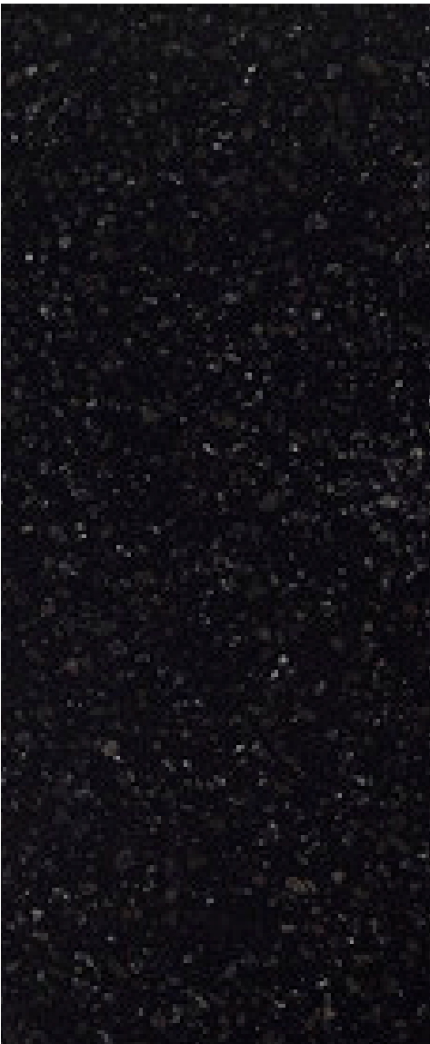
Deep Night Sky